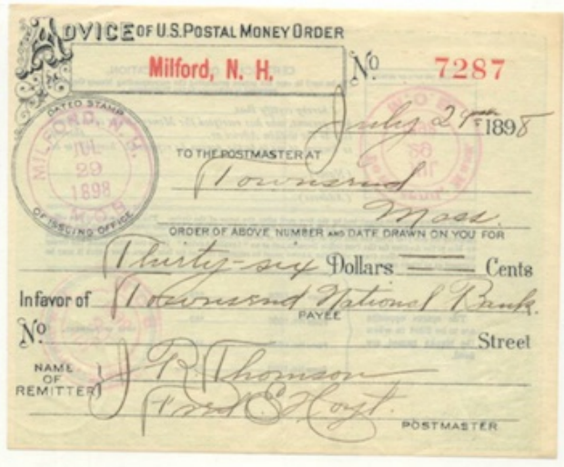
US Postal Service money order, c1898.

1869, connecting the two coasts together with nearly 2,000 miles of track. By 1900, four more set of transcontinental tracks spanned the country, allowing for far more efficient transportation of people and products.