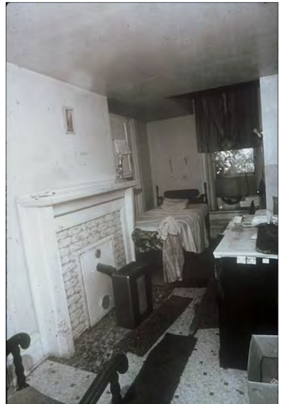
The Rosson House family parlor, prior to restoration.