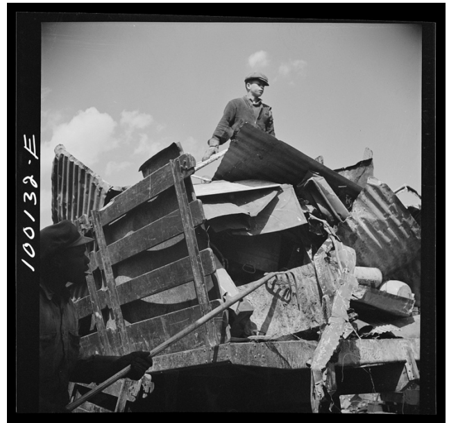
A boy stands on a pile of scrap metal during a World War II recycling drive. Do we see decorative metal ceiling panels directly under him??

Additional Info – Since you’ve gotten this far, we thought we’d give you a little more info about the Rosson House ceilings. When you look at some of the pictures or go on a tour, sometimes you’ll see a metal disk in the ceiling, sometimes painted and sometimes not, and you’ll think, “What is that??” The answer is that those