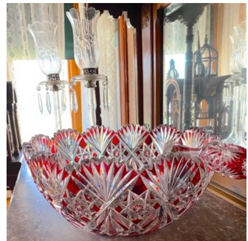
An antique cut glass punchbowl on display at Rosson House.

Ruby or cranberry glass was popular, both before and during the 19th century. Why? Some may have liked the color, as rich, deep hues were considered fashionable at the time Rosson House was built in 1895, but others may have just seized the opportunity to show off. Because though glass is made up of a combination of silica sand, soda ash/potash, and limestone, if you want your glass to be a specific color, you have to add a certain powdered metal oxide or sulfide to it. The oxide you'd use to make red glass is gold, making it more rare and more expensive.