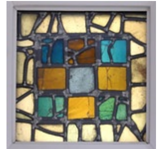
A 7th century stained glass window from St. Paul's Monastery in Jarrow, England.

Before glass windows were readily available and affordable, windows were made of many things, including parchment, oilcloth, mica, or thin sheets of animal horn or animal skins. Sometimes they were simply window frames without anything in them, but with shutters to close against the elements or for security. Glassmaking in general is believed to have originated around 4,000 years ago in Mesopotamia. Glass was first used in windows – little more than small pieces of partially translucent glass set into walls – around 2,000 years ago in Roman bathhouses. As early as the 7 th century CE, churches and monasteries in Europe were installing windows made of pieces of thick, flat, colored glass held together with iron and lead framework, like the antique square-shaped one you see here (which honestly reminds this author of something you might find in a Frank Lloyd Wright home...).